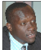
Sports and Culture Minister Joseph Habineza.